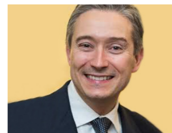
François-Philippe Champagne Minister of Innovation, Science and Industry, Government of Canada

SESSION 5 - Enabling Policies to unlock decarbonisation