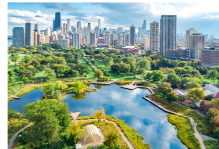
Net Zero Mission