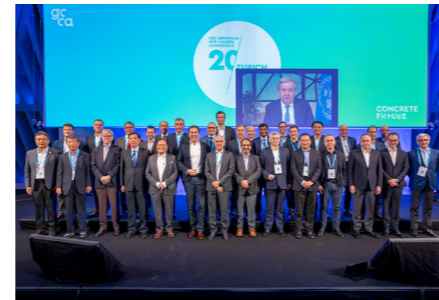
GCCA and industry Strategic Discussions