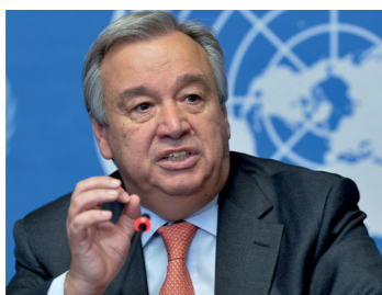
António Guterres (Special industry message) Secretary-General of the United Nations