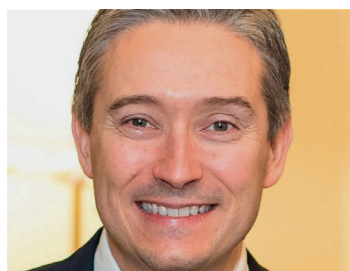
François-Philippe Champagne Minister of Innovation, Science and Industry – Government of Canada

The Honourable François-Philippe Champagne was first elected in 2015 as the Member of Parliament for Saint-Maurice—Champlain. He now serves as the Minister of Innovation, Science and Industry in Canada's 42nd Parliament. He is a businessman, lawyer, and international trade specialist with over 20 years' experience at large international companies in Europe, particularly in the fields of energy, engineering, and innovation.