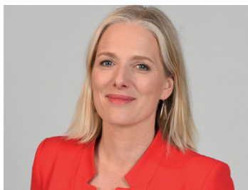
Catherine McKenna Former Climate Minister & Chair UN High-Level Expert Group on the Net-Zero Emissions Commitments

António Guterres has served as Secretary-General of the UN since 2017, the ninth person to hold this title. A member of the Portuguese Socialist Party, Guterres served as prime minister of Portugal from 1995 to 2002.