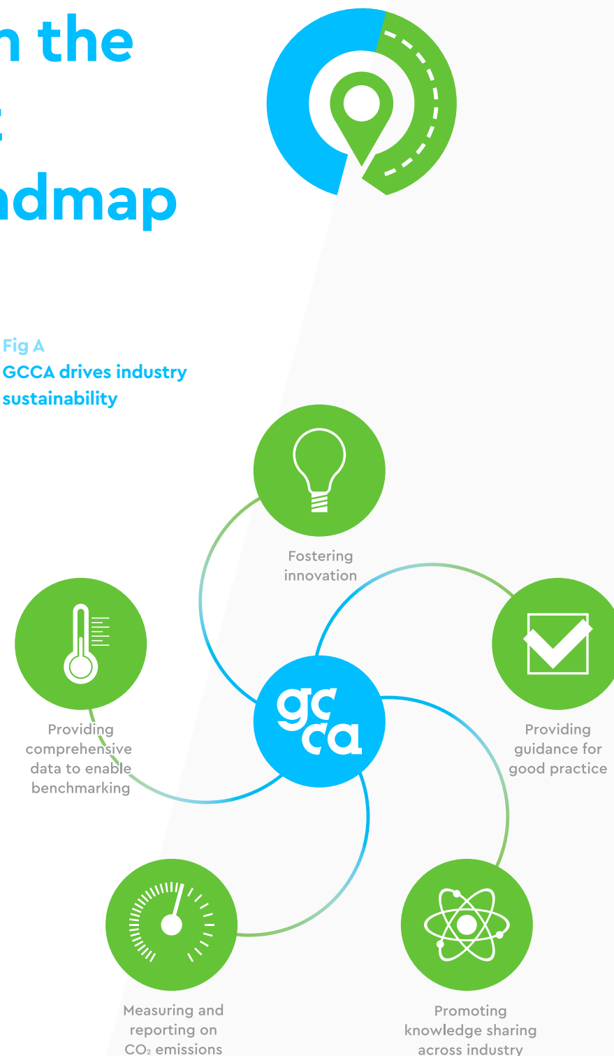
Fig A GCCA drives industry sustainability

Concrete is the vital building material that has shaped our modern world.